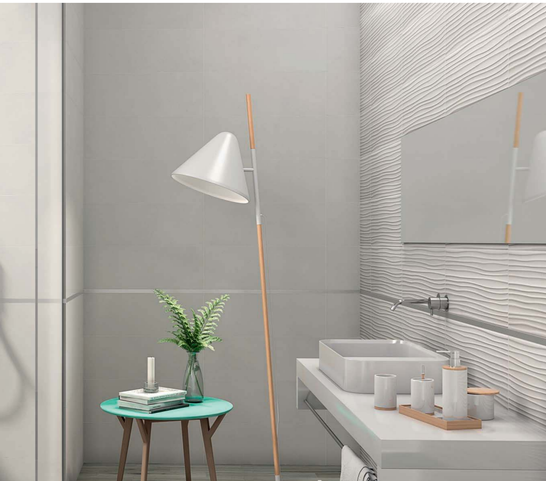
Rvto. / Wall / Rvtm.: At. Mist Light 25x70 - At. Mist Duna Light 25x70