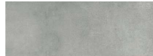
● At.Mist Perla 25x70 M08 2.185.37.3679 ●