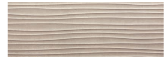
● At.Mist Duna Tortora 25x70 M08 2.185.297.3696 ●