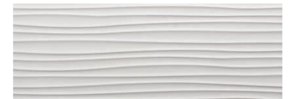
● At.Mist Duna Light 25x70 M08 2.185.204.3696 ●