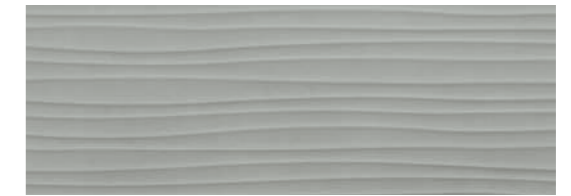
● At.Mist Duna Perla 25x70 M08 2.185.37.3696 ●